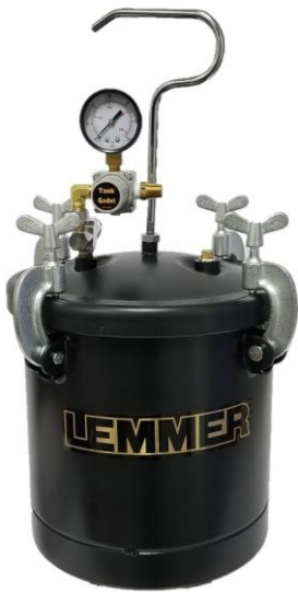
L011-126 2.25 Gallons

These tanks are designed for pressure casting of rubbers and liquid plastics. The die-casting of the resins allows to obtain parts practically without bubbles. Recommended pressure is 60 psi. (Can go up to 70 psi). Air compressor not included.