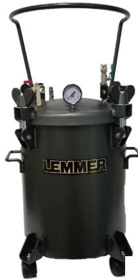
L011-127 5 Gallons