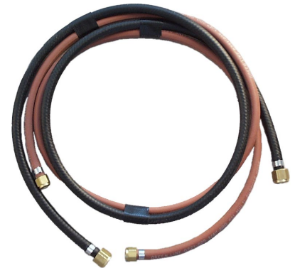
Hose and Fittings