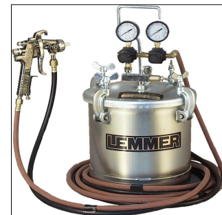
Typical remote system shown here with 2.25 gallon tank and 15' hoses.