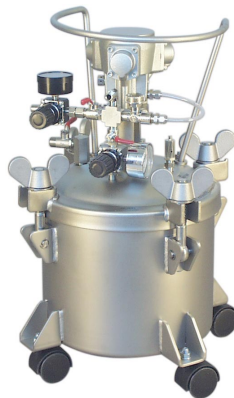
Cuve en acier inox