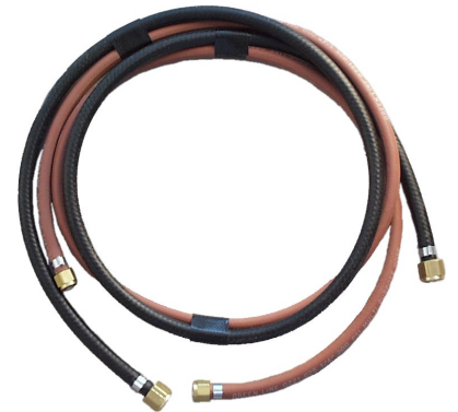
Boyau et Raccords