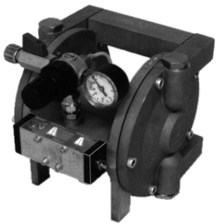
Pompe de Transvasement