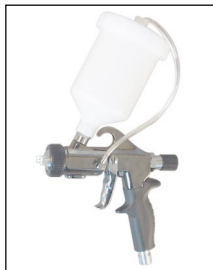
Order # L080-509