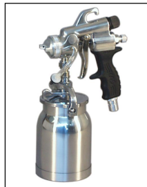
Order # L081-050