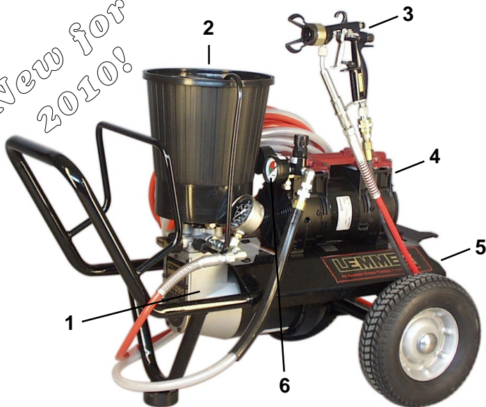
Order complete as shown, pn# L014-400